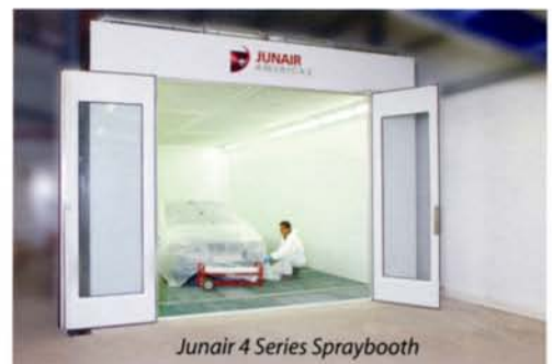
Junair 4 Series Spraybooth

QADs™ world leader with proven technology and over 10 years experience