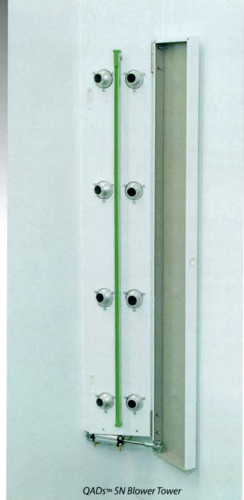
QADs™ SN Blower Tower

QADs™ SN - In addition to QADs™ on Bake features, includes static neutralization system to neutralize static electric charge prior to painting and reduces it throughout the spraying, flash-off and baking processes.