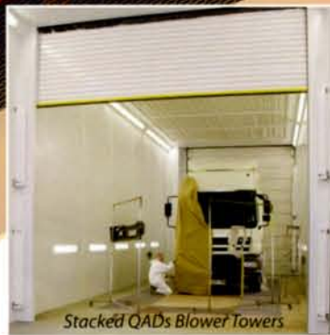
Stacked QADs Blower Towers

Over 4,000 QADs installations worldwide . . . and growing daily!